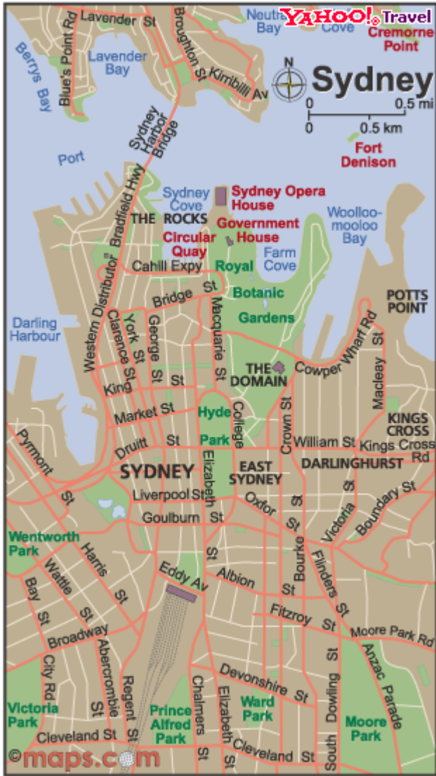
Map of Sydney City